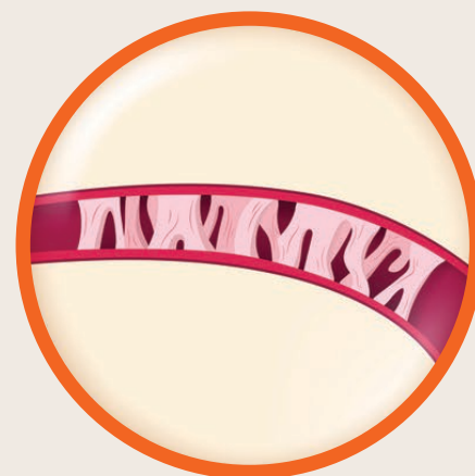
BLOCKAGE IN TUBE